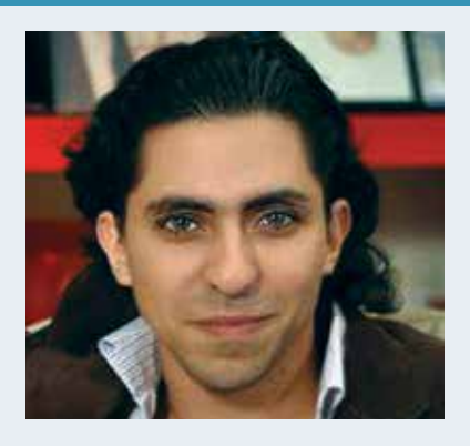
COUNTRY Saudi Arabia KEY FACT Blogger DETAINED SINCE June 27, 2012

CHARGES Insulting Islam and breaking the anti-cybercrime law