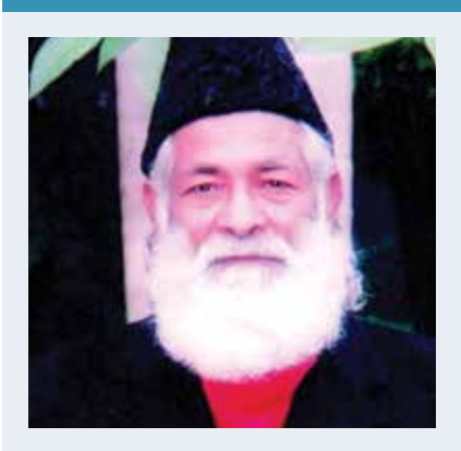
COUNTRY Pakistan KEY FACT 80-year-old Ahmadi manager of a bookshop and optician store