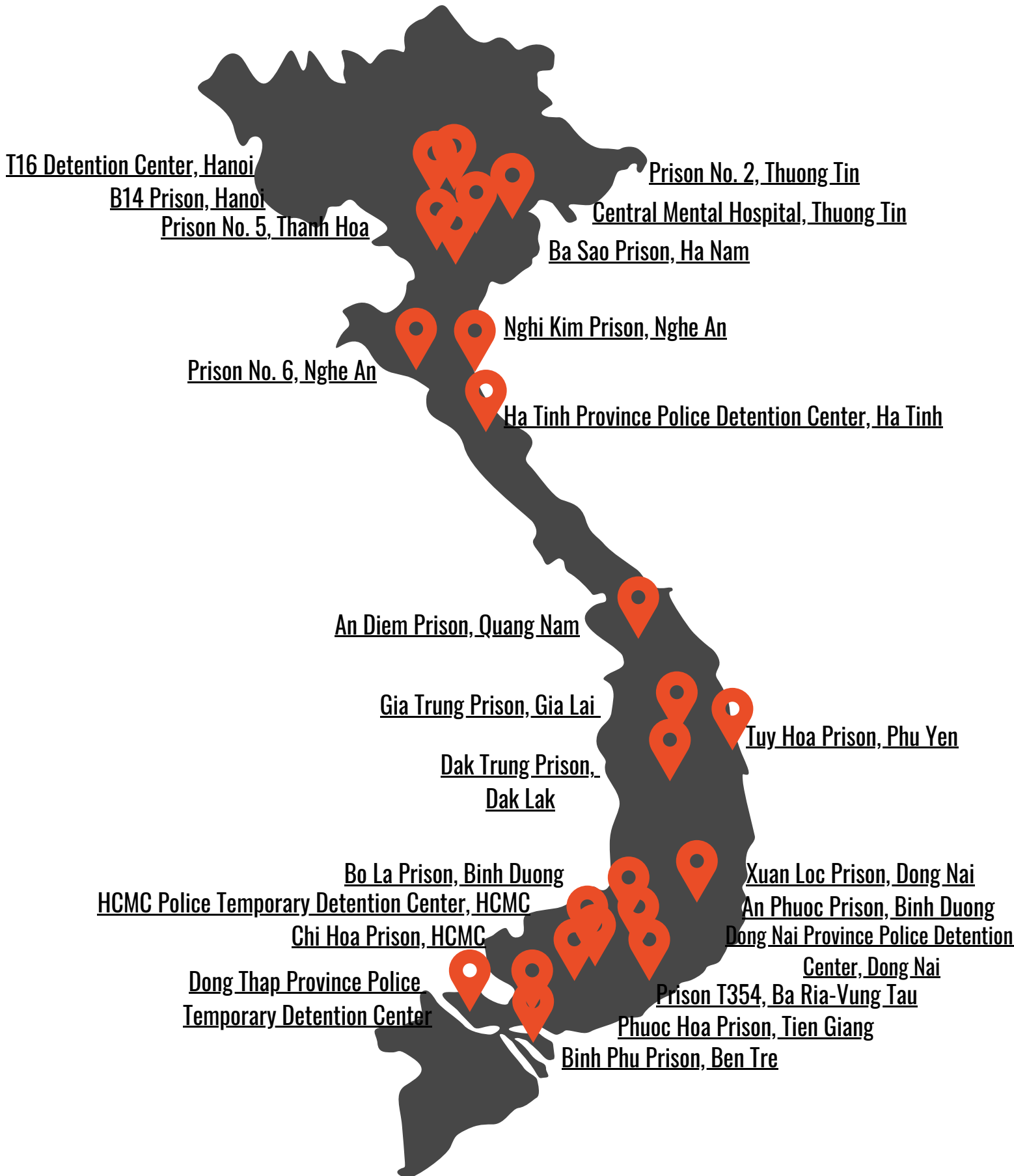
Graphic 1: Visual representation of prison locations in Vietnam that are mentioned in this report