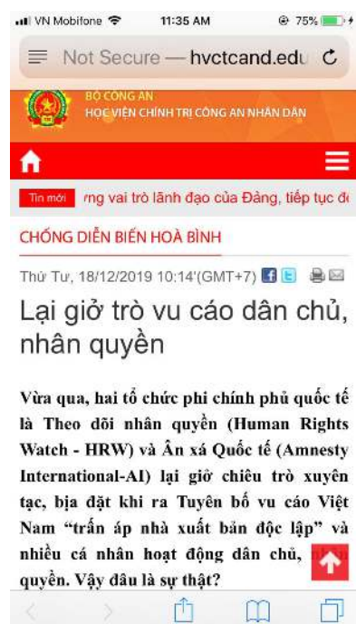
Screenshot of the article published on the official website of the Police's Academy of Politics.

Recently, two international NGOs--Human Rights Watch (HRW) and Amnesty International (AI)--resorted to misrepresentation and fabrication when they made a statement slandering Vietnam, accusing it of “cracking down on an independent publishing house” and democracy & human rights activists. So where’s the truth?