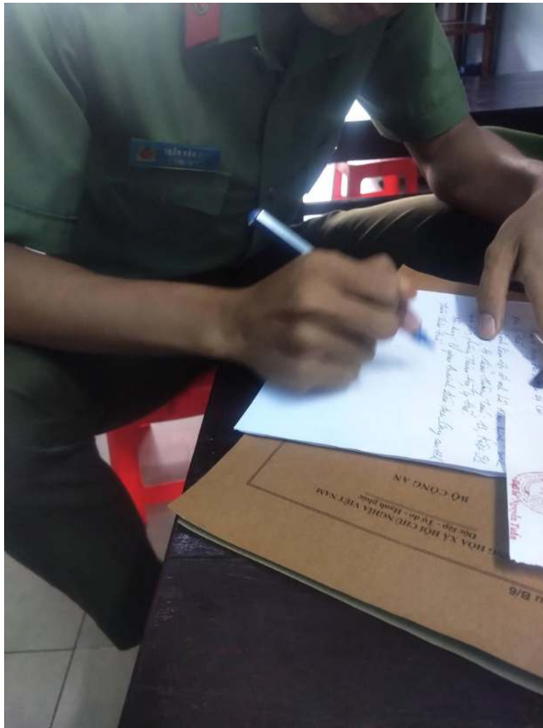
A security officer questioning one of LPH's readers in central Vietnam after conducting a house search on November 13, 2019.