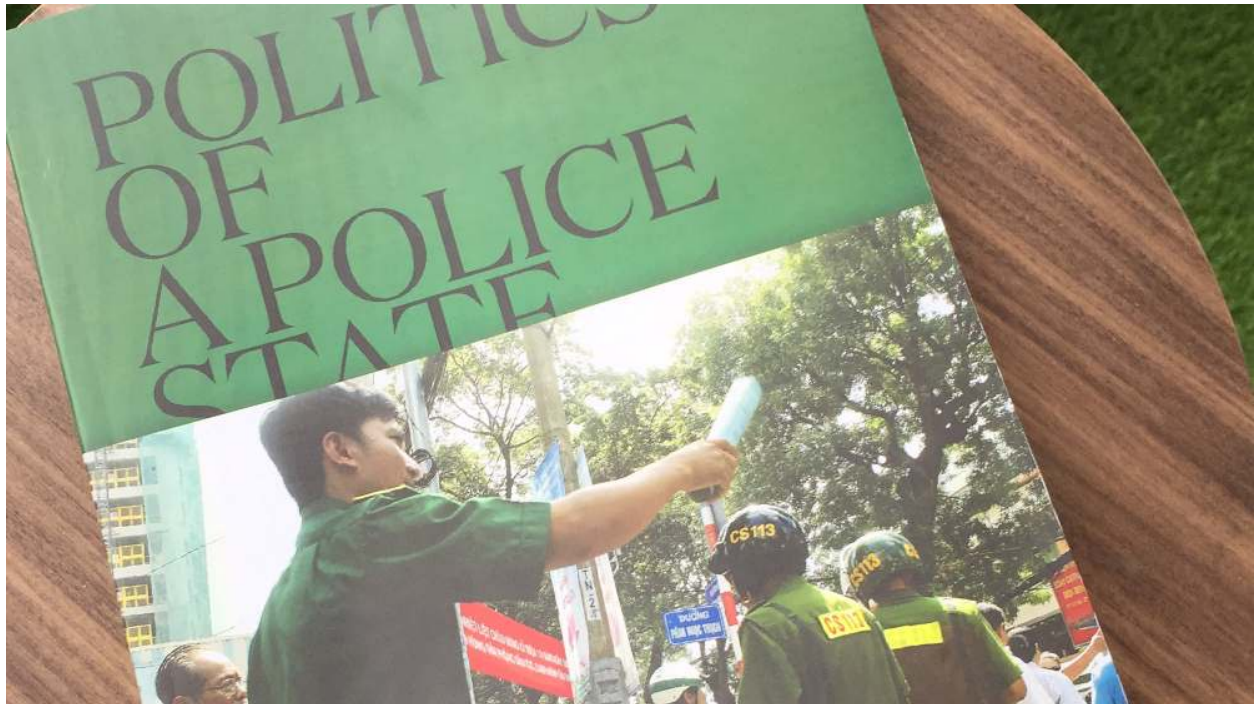
A Samizdat book from Vietnam's Liberal Publishing House whose readers are mainly from the country's remote and poorer areas