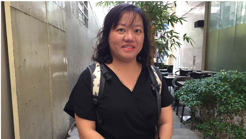
Liberal Publishing House has published dissident author Pham Doan Trang's latest books Politics of a Police State and On Non-violent Resistance Techniques.

The government has long censored and controls its media and publishing industries and imposed tight restrictions on them.